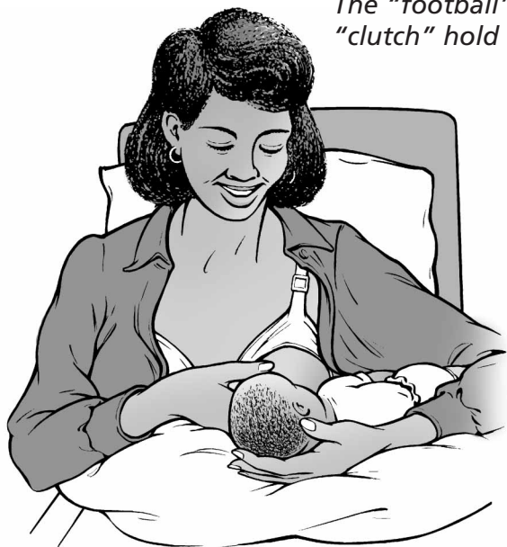
The "football" or "clutch" hold

Lying down can be a comfortable position for breastfeeding, especially at night or when sitting is uncomfortable.