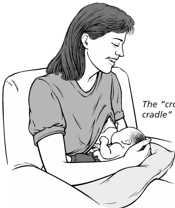
The "cross- cradle" hold

Hold the baby across your body in the arm opposite the breast from which she will be feeding. Her position will be the same as in the "cradle" hold, but you will use the other arm to hold her. The baby should be at the level of your breast, with her whole body turned toward you.