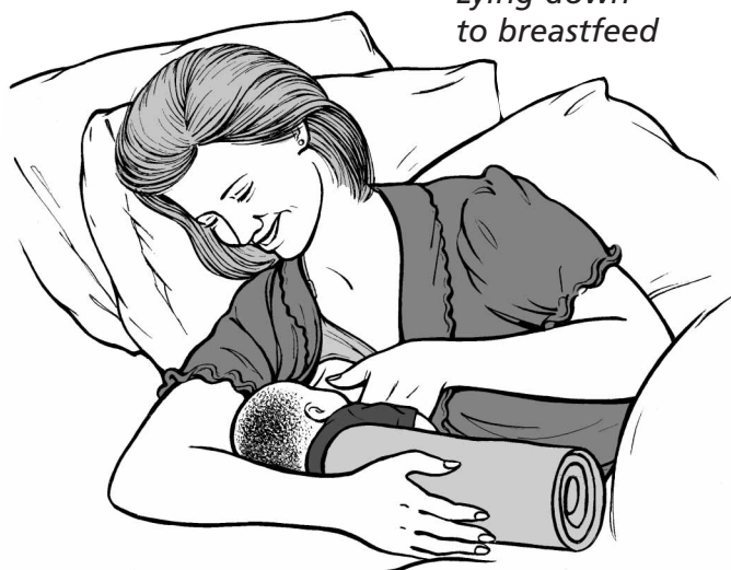
Lying down to breastfeed

The "cross-cradle" hold is another position in which you will be sitting. It is a good position to use if you are concerned about correct latch-on or if you are feeding a small or premature baby. You have control of the baby's head and can see the latch-on more clearly than when using the traditional "cradle" hold.