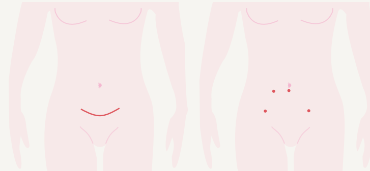
Open Myomectomy Incision

A common alternative to hysterectomy is myomectomy — or surgical removal of uterine fibroids. This procedure preserves the uterus, and may be recommended for women who could become pregnant. Myomectomy is often performed through a large abdominal incision. After removing each fibroid, the surgeon carefully repairs the uterus, to minimize potential bleeding, infection and scarring. Proper repair of the uterus is critical to reducing the risk of uterine rupture during pregnancy.