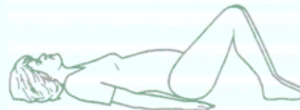
Pelvic Rock (on your back)